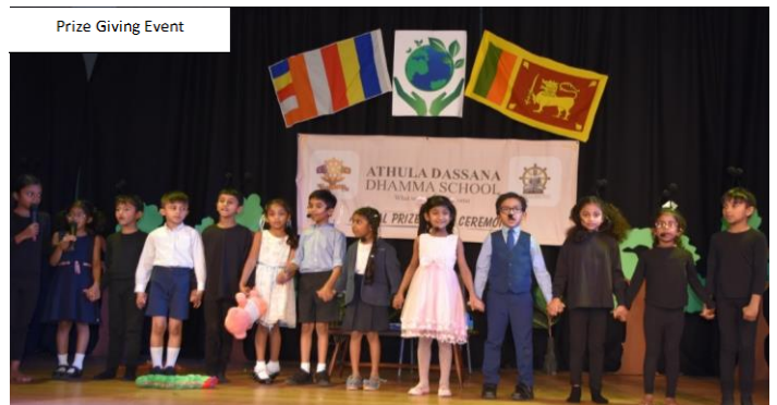
Prize Giving Event