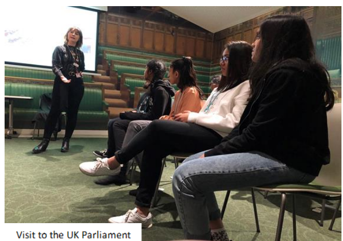
Visit to the UK Parliament