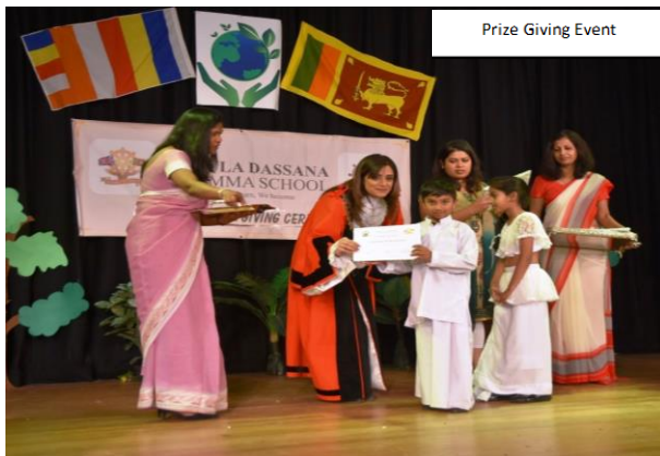
Prize Giving Event